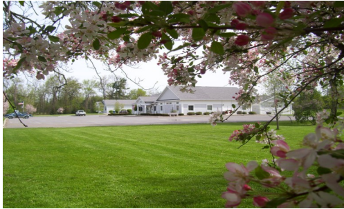
STAFFORD TOWN HALL