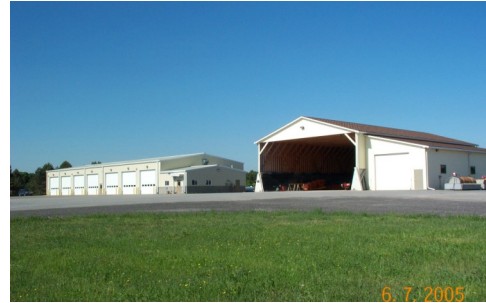
STAFFORD HIGHWAY DEPT.